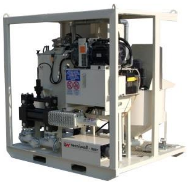
LCD Pump Control panel (optional) with recording system and preset volume / pressure injection control